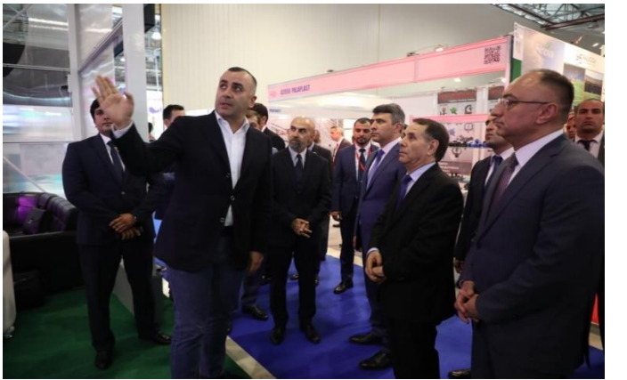
CASPİAN AGRO 2019 BAKU / AZERBAIJAN